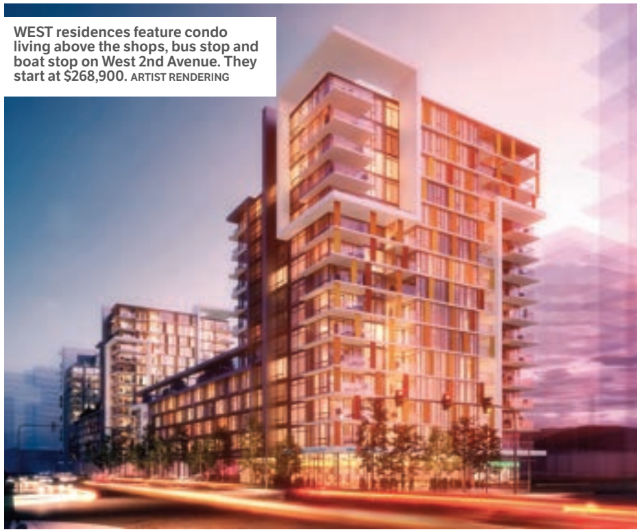
WEST residences feature condo living above the shops, bus stop and boat stop on West 2nd Avenue. They start at $268,900. ARTIST RENDERING

Plus, WEST residents will only be one short bridge away from downtown. Yet, with starting prices at $268,900, buyers can expect to pay approximately $20,000 to $50,000 less for the same size unit at WEST than they would in, say, Yaletown. And really, come summer, being able to walk over the False Creek inlet is more of a bonus than a hindrance. With all that in mind (price, location and amenities), when these suites hit the market this spring, you can bet they'll be scooped up pretty darn fast.