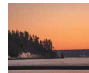
ICONIC NATURE STANLEY PARK