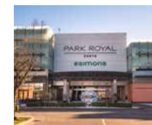
WALKABLE LIFESTYLE PARK ROYAL

Gracefully perched at the entrance to Park Royal, Executive on the Park is a distinctively rare living experience. Enveloped by the softness of nature, these one-of-a-kind one to three-bedroom homes combine luxury and hospitality, with high-end à la carte services, sophisticated design, and unwavering quality. Bordered by the sea and mountains, and with a reputation for both prestige and charm, West Vancouver is the Lower Mainland's most coveted community to call home. Life is meaningful, connected, and refined at Executive on the Park — a residential opportunity that rarely arises.