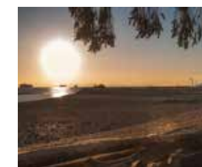
PEACEFUL SCENES AMBLESIDE BEACH